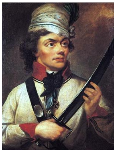
Ignacy Jan Paderewski (1860-1941)