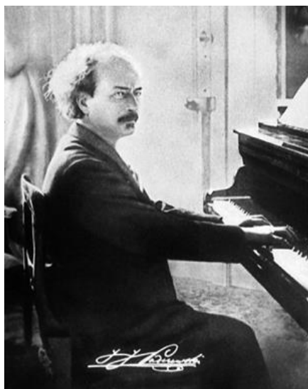
Józef Wybicki (1747-1822)